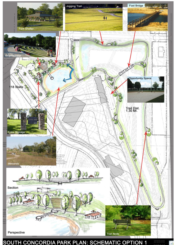
SOUTH CONCORDIA PARK PLAN: SCHEMATIC OPTION 1

On July 13, 2011 a meeting took place to discuss two possible park plan designs. Input was given by many of the stakeholders as well as the surrounding business owners. An updated design will be given by the architects with the new recommendations in the coming months. Main points of the design will be an approximately 20 foot trail going the complete distance around the flood control pond area (a portion of this would be paved for walking/biking and a portion would be grass for cross country meets), an amphitheater hoping to seat 200+ people and a fountain for aeration in the larger pond.